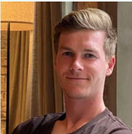
Mitchell Browne Insurance Design, Auckland

Like most Brokers, my early working career was a far cry from the Insurance Industry. I spent nearly 10 years as a Football Coach while also running my passion project, Playball Hibiscus Coast, teaching 2-4-year-olds essential sports skills like running, throwing, and jumping.